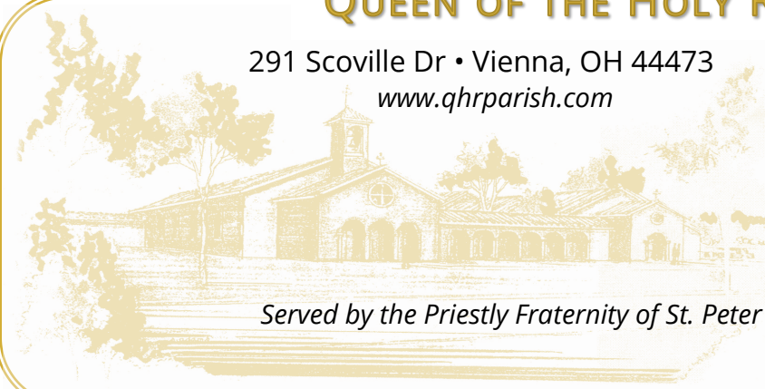
Served by the Priestly Fraternity of St. Peter